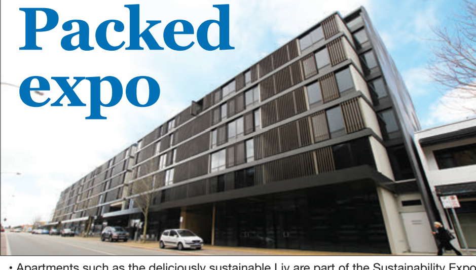
· Apartments such as the deliciously sustainable Liv are part of the Sustainability Expo

Mr O'Byrne is one of the many homes opening up for Sustainable